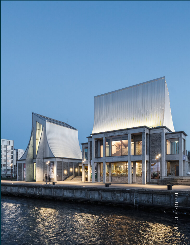
The Utzon Center

The Utzon Center is a vibrant cultural centre on the Aalborg waterfront. The centre was designed by famous Danish architect Jørn Utzon who was raised in Aalborg and is the architect behind the Sydney Opera House.